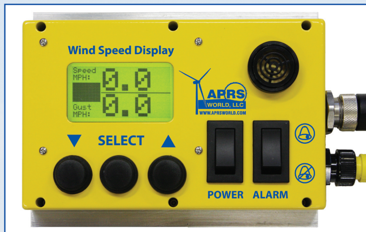
Easy-to-Use Interface with LCD Screen, Setup Buttons, Alarm, and Alarm Cancel Switch